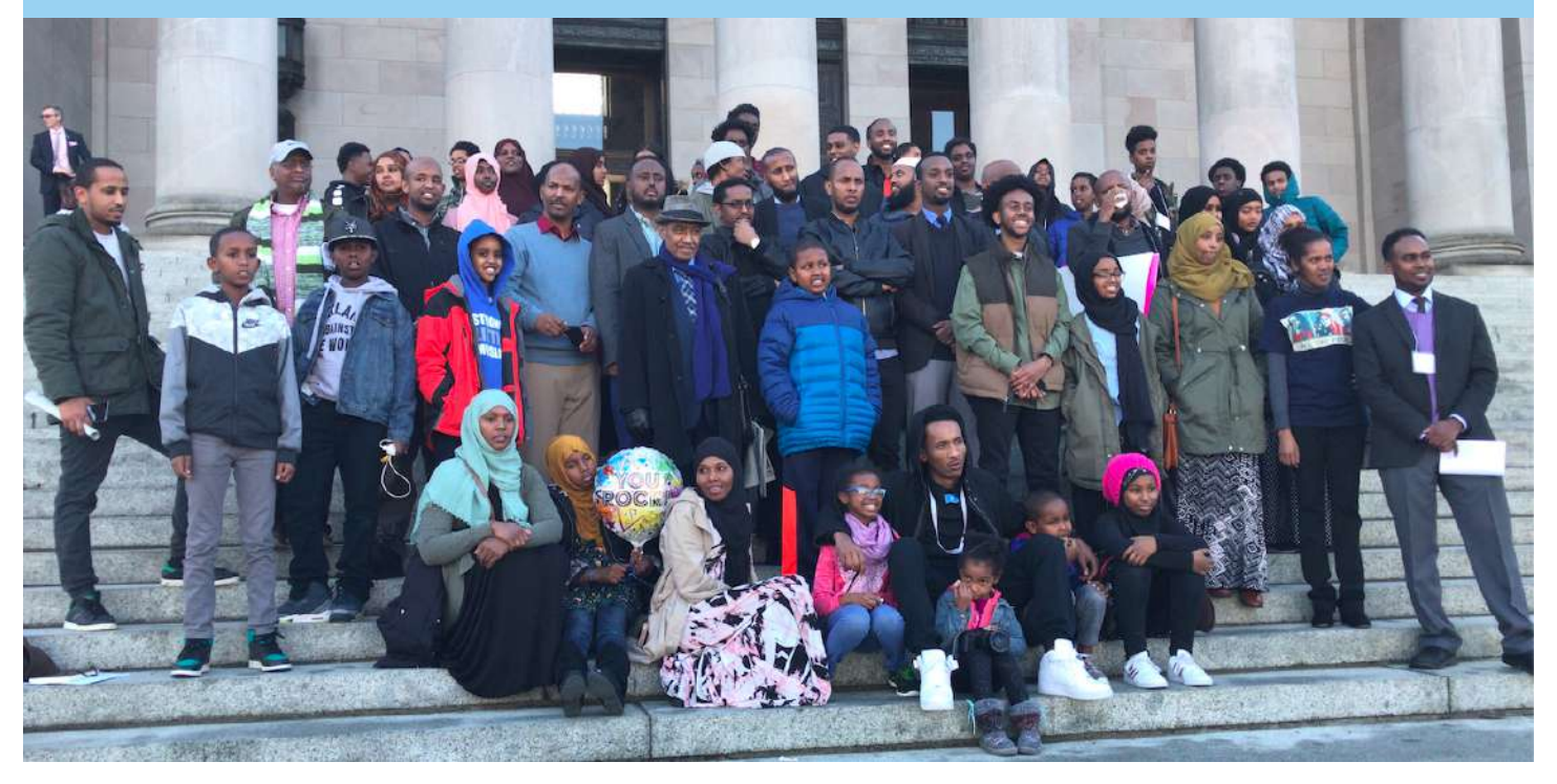
1st East African Lobby Day in Olympia, at the steps of the Capitol building.

Through Seattle Foundation's funded project, the East African Political Awakening Project took off in 2017 in partnership with three other East African community led organizations; Companion Athletics, CARE Center and ADWA. The coalition joined unified collective approach in civic engagement, policy and systems advocacy work, with an ultimate goal developing community's leadership skills and organizing for collective courses.